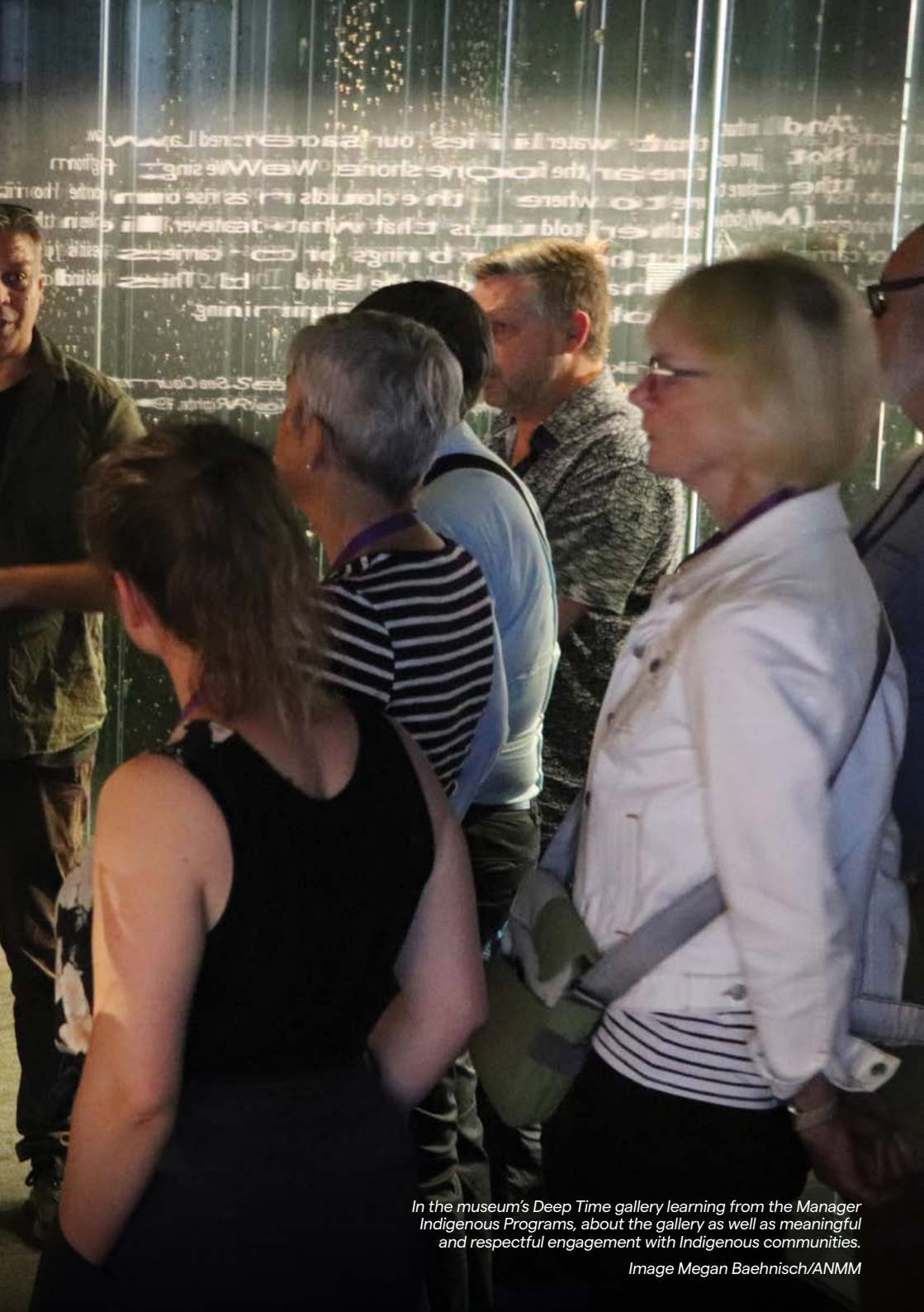
In the museum's Deep Time gallery learning from the Manager Indigenous Programs, about the gallery as well as meaningful and respectful engagement with Indigenous communities.